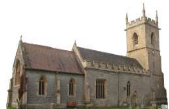
Hinton on the Green